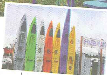
Above: View of Half Moon Bay from Sam's Chowder House. Left: A quiver of kayaks ready for rentals at Half Moon Bay Kayaks.

If you've driven between San Francisco and Santa Cruz along scenic Highway 1, you've passed through Half Moon Bay. Chances are, you were on your way to somewhere else, and your experience was that of stop lights and fast food restaurants along a congested main thoroughway. But Half Moon Bay is so much more than what meets the eye as you pass through, for just off Highway 1 is the heart of Half Moon Bay, and it's worth taking some time to explore this quaint beach town.